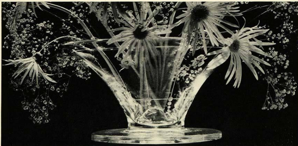
A new Steuben bowl that makes arranging flowers a new joy. Only $15. Steuben crystal is a product of the Corning Glass Works, Corning, New York.